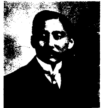
THE NEW CHINESE CONSUL.

The photo shows a model executed in Mount Somers stone by Mr. W. H. Feldon, of Auckland, of Major Kemp, as a guide in carving a full-sized figure in marble, which is to be placed in the public park at Wanganui.