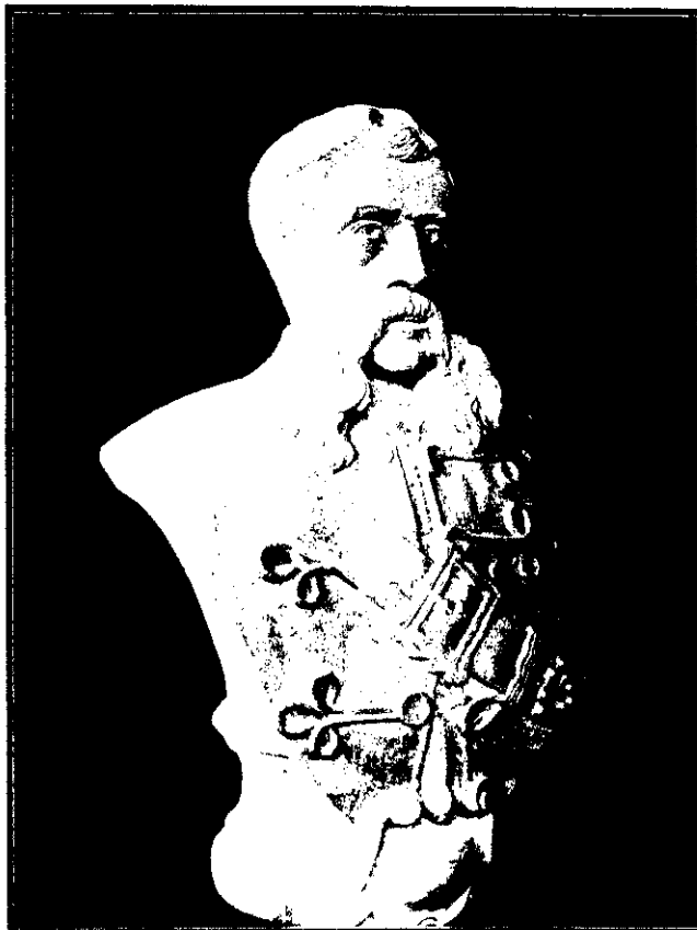
A STATUE FOR WANGANUI.