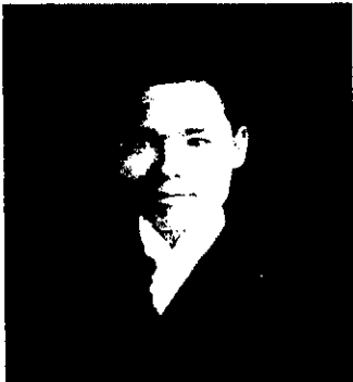
A JAPANESE PEACE EMBASSY.