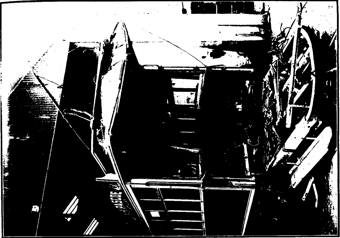
THE FRONT OF THE RUNAWAY CAR, SHOWING HOW THE COLLISION DEMOLISHED THE MOTORMAN'S PLATFORM.