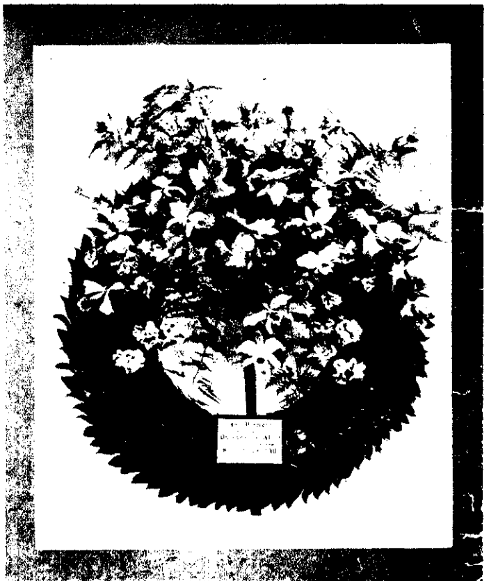
IN HONOUR OF THE MEMORY OF KING EDWARD The wreath placed on the tomb of the late King Edward by Sir Joseph Ward on April 6th, the anniversary of His Majesty's death.