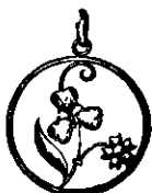
J 3971.—9ct. Gold Opal Set Pendant, 22/6