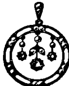
J 1918.—9ct. Gold Peridot and Pearl, or Turquoise and Pearl Pendant 32/6