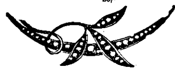
F 593.—15ct. Gold Pearl Set Half Moon and Spray Brooch, in a Morocco Case, £5/10/-