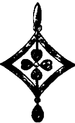
J 2233.—9ct. Gold Enamelled Pendant set with Tourmalines 23/3/-