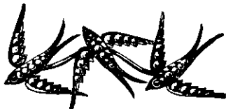
F 3745.—15ct. Gold Pearl Set Brooch (Flight of Swallows), in a Morocco Case, £6 10/-