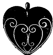
J 3361.—9ct. Gold-mounted Greenstone Heart, 16/6