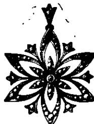
H 6377.—9ct. Gold Pearl Set Pendant, or Brooch, in a Nice Case, 24/-