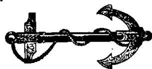
J 1044.—9ct. Gold-mounted and Greenstone Anchor Brooch, 15/6