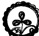
J 2771.—9ct. Gold Brooch, Set with Garnets and Pearl, in a Nice Case, 27/6