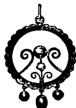
J 2994.—9 ct. Gold Turquoise and Pearl Set Pendant, 25/-