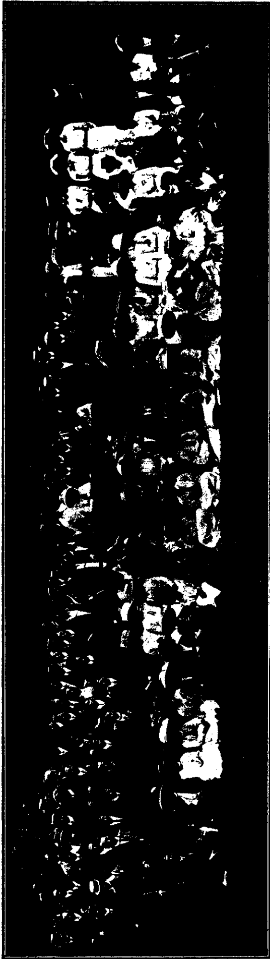
NEW ZEALAND UNIVERSITY STUDENTS WHO ATTENDED THE ANNUAL CHAMPIONSHIP TOURNAMENT IN AUCKLAND.