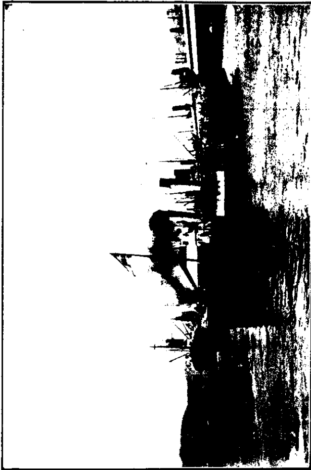
ST. PATRICK'S COLLEGE TERTIARY CELEBRATIONS. The clergy visiting Wellington to take part in the jubilee celebrations of St. Patrick's College were entertained at Invercargill at Invercargill on Monday. The photo shows the steamer Duchess leaving Wellington with the guests on board.