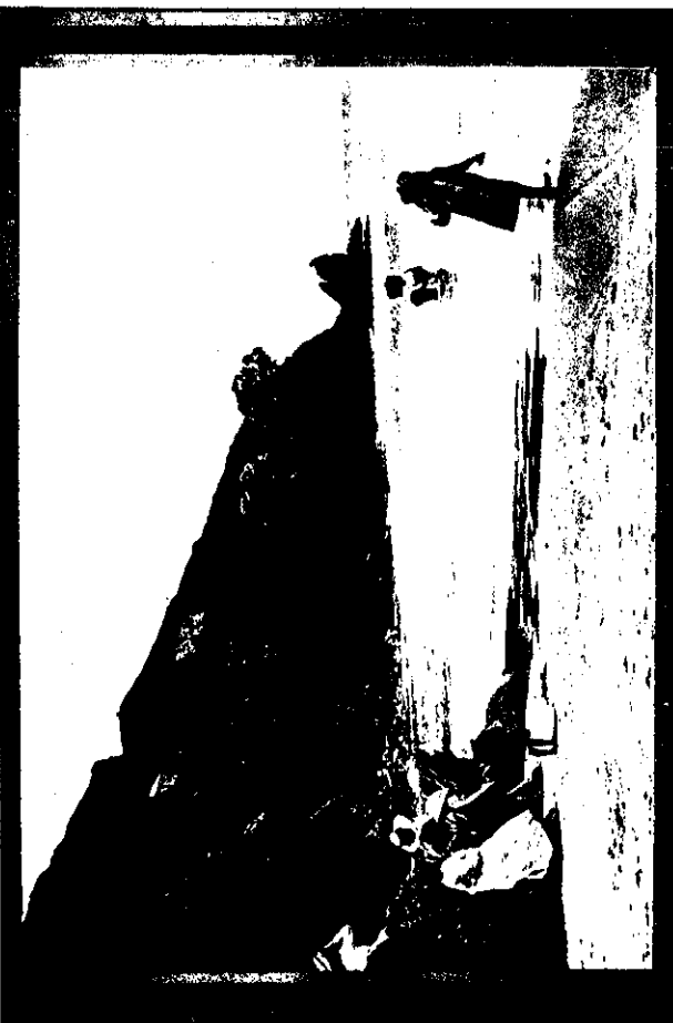
OPENED TO THE PUBLIC—A SEASIDE RESORT FOR WADDELL. The photo shows the Waddell beach, to which a new road has just been opened up, substantially shortening the journey from the town. The beach is about four miles long, and is a favorite resort of the people of the district. The Waddell Beach G.M. Company's name may be seen just appearing over the conical point, three-quarters of the way up the headland.