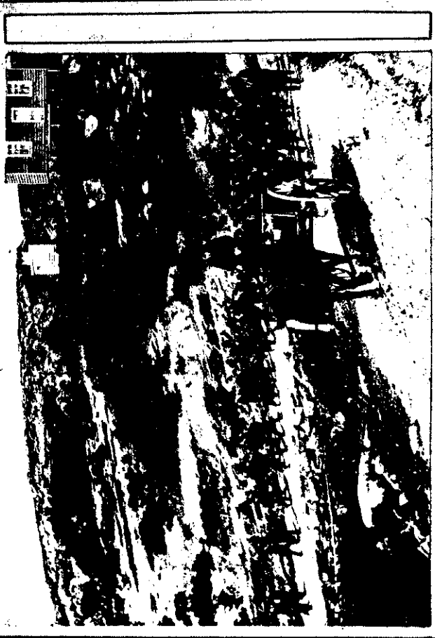
TWO MINERS KILLED AT DENNISTON.

A big fall of earth and stone in the Westport Coal Company's Denniston mine, occurred on October 26, resulting in the deaths of two miners, Messrs. Malt and Malt. The bodies of the two men were recovered by further falls of stone. Both bodies were subsequently recovered. The upper photo, shows the men outside the mine waiting to hear if there was any hope, while the second picture shows the funeral procession.