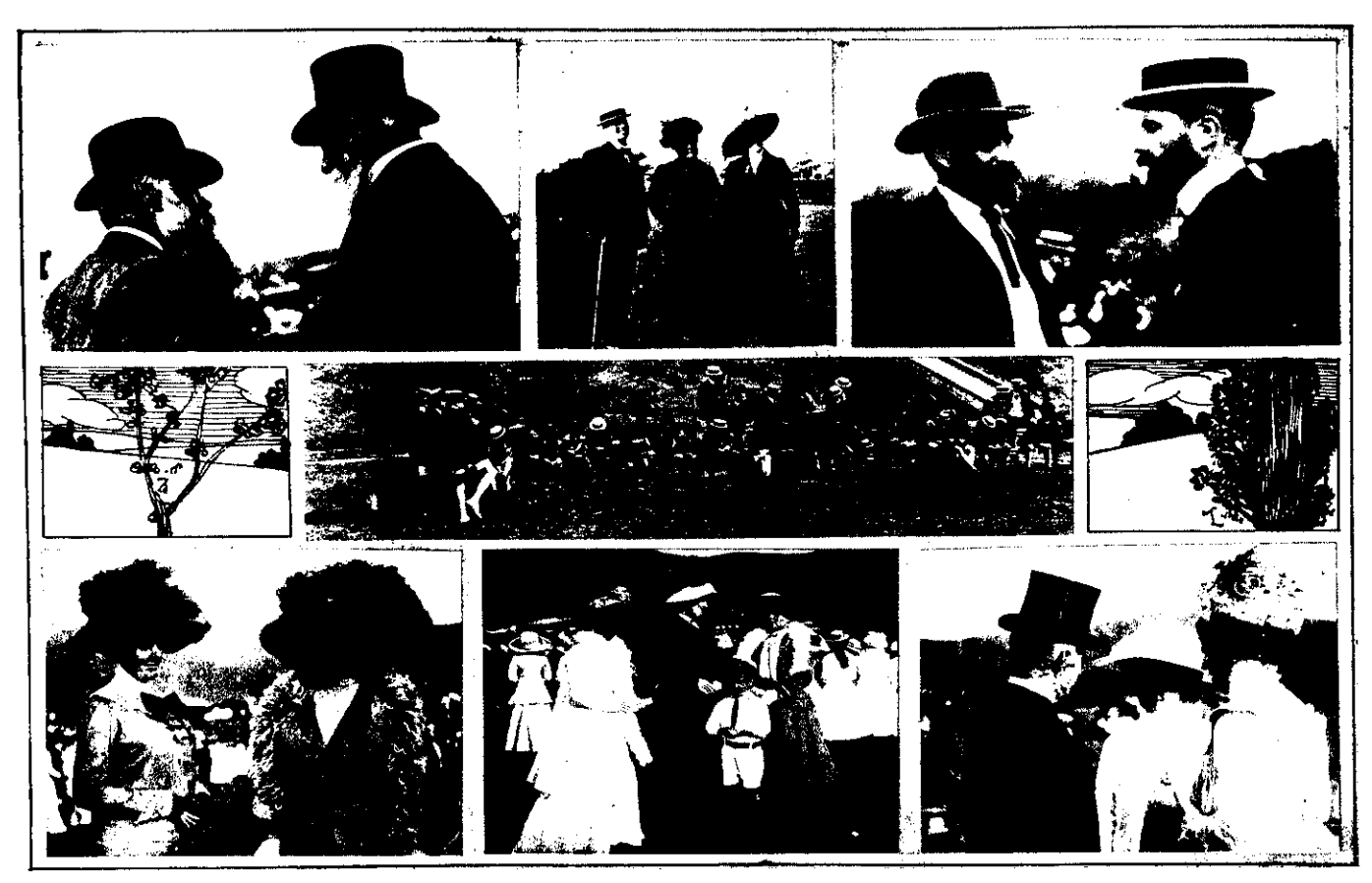
VISITORS WHO ATTENDED THE WELLINGTON COLLEGE SPORTS.