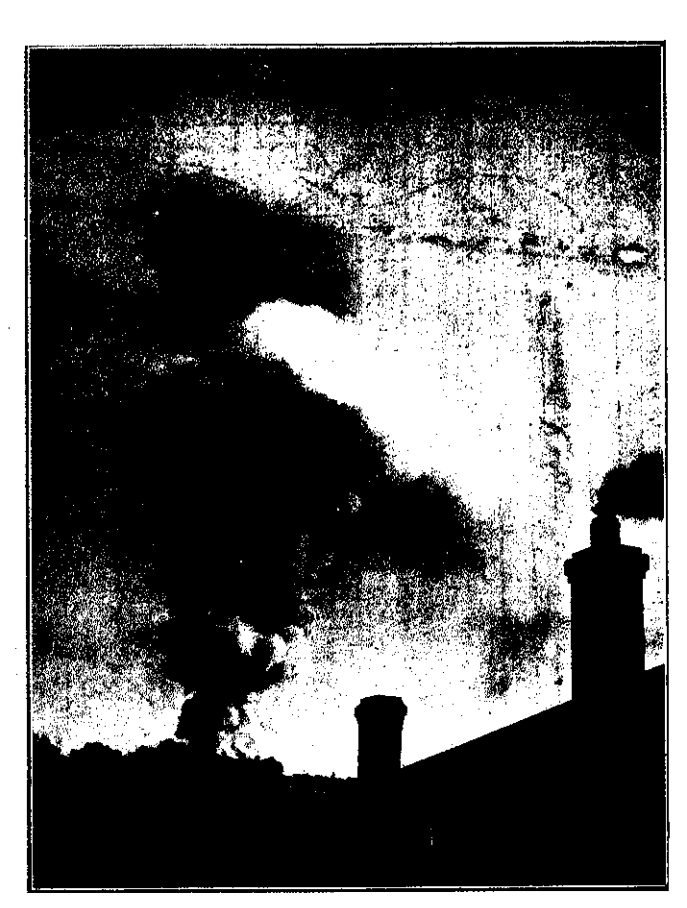
A MAORI GIRLS' SCHOOL BURNED DOWN. The photo shows the destruction of the Hukarere Maori Girls' School, near Napler, early on the morning of October 21. The building (one of forty rooms) was very old, and the flames spread with great rapidity, giving the girls barely time to escape in night attire.