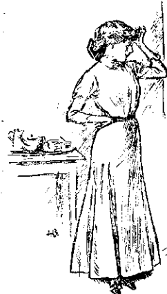
The girl glanced first at the small mirror.

"There are some matters," he contended, reviving under the goad of argument, and beginning to stride about the room, "some matters that needn't be told to everybody. There's such a thing as being too straightforward and too outspoken. It isn't good for us to know too much. That's why I've never held with those people who profess to be able to tell you what's going to happen just by looking at your palm. There's no sense in it, for one thing, and, for another, if there was any sense in it, there'd be no advantage in ascertaining beforehand what was going to happen. The future's