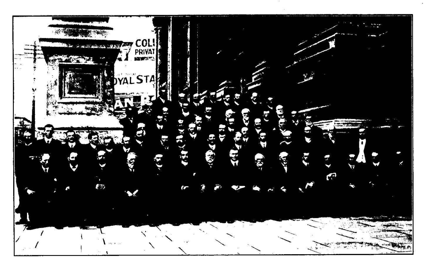
DELEGATES WHO ATTENDED THE RECENT MUNICIPAL CONFERENCE IN WELLINGTON.