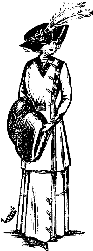
THE NEW RUSSIAN COAT AND SKIRT.

Coat and skirt costumes in serge, tweed, and cloth will be very much in evidence, the skirts made in quite a short walking length, and the coats cut fairly long, but neither so long nor so tight-fitting as they were last year. Those who are slim and slight will rejoice in the revival of the Russian blouse, for