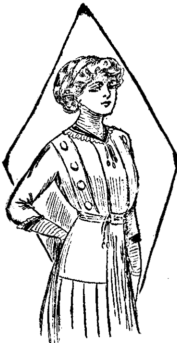
A TRIM LITTLE FROCK FOR MORNING WEAR.

To be made in light-weight cloth. A pretty shade of saxe blue is suggested, with narrow collar and cuffs of black panne.