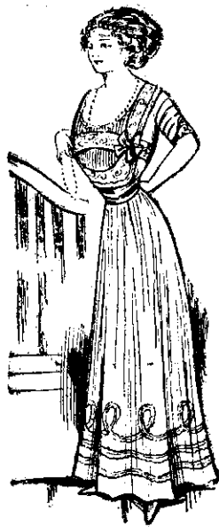
YOUNG LADY'S DANCE GOWN,

Peter Pan collars are still popular. Not only do they appear on the house gown, the smart afternoon toilette, but they are being worn with cuffs to match with