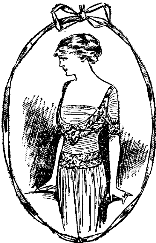
AN EVENING FROCK

In Ninon or net over satin, trimmed insertion and ruffled ribbon.