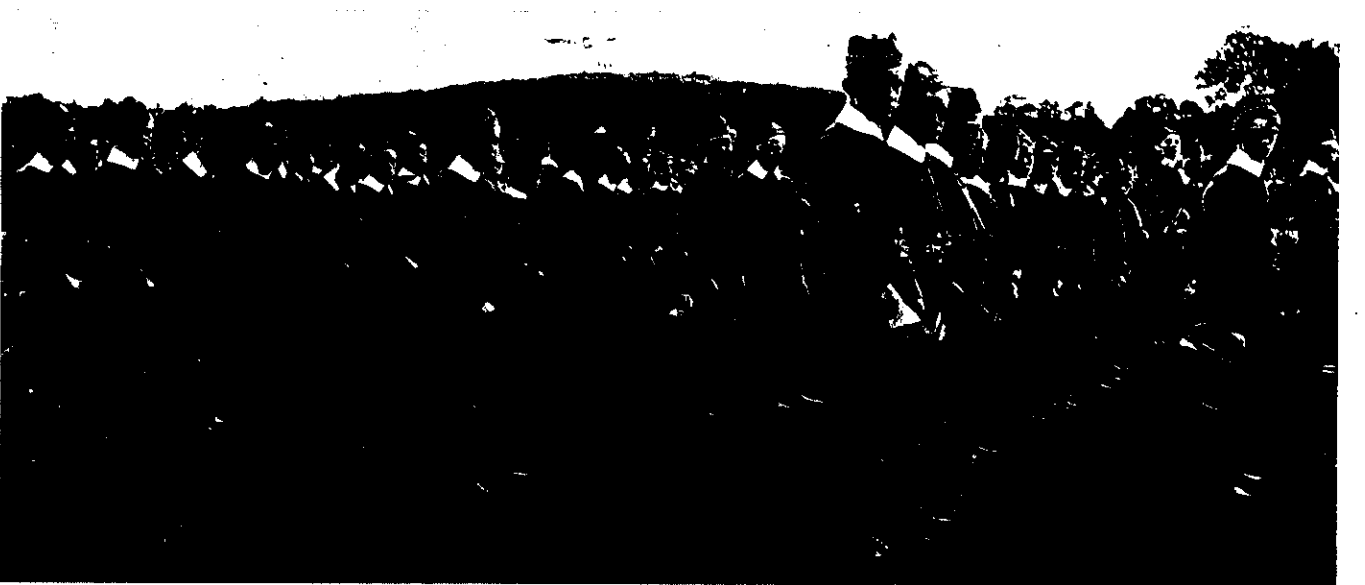
PUBLIC SCHOOL CADETS.

THE DEFENCE OF OUR DOMINION—SOLDIERS IN THE MAKING.