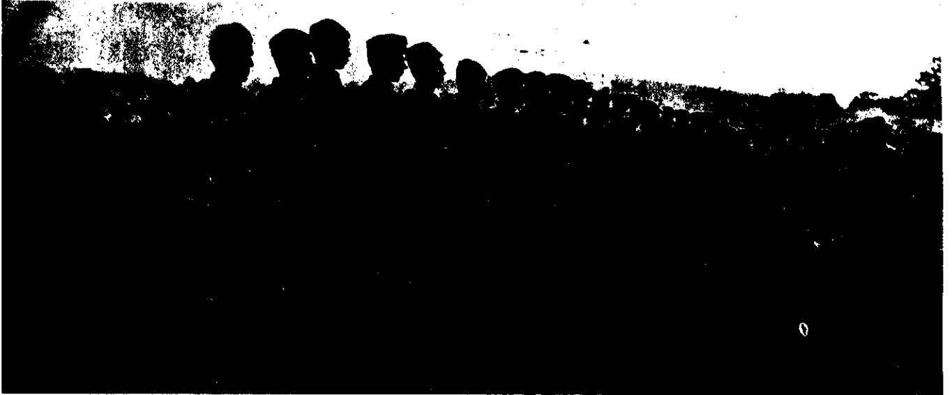
ST. JOHN'S COLLEGE DEFENCE CADETS.