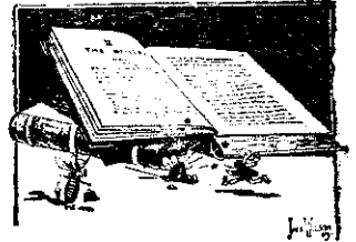
"Hurt you, bill?" "No, I guess not; I only fell from the second story."

She: "Waste is sinful." He: "Not always. I know a waist which is angelic!"