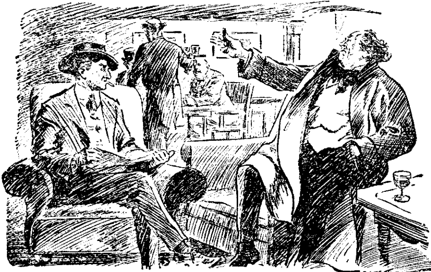
The Actor: "There was a thunder of applause when I left the stage." The Bored One: "Serves you right. You shouldn't stay on so long!"