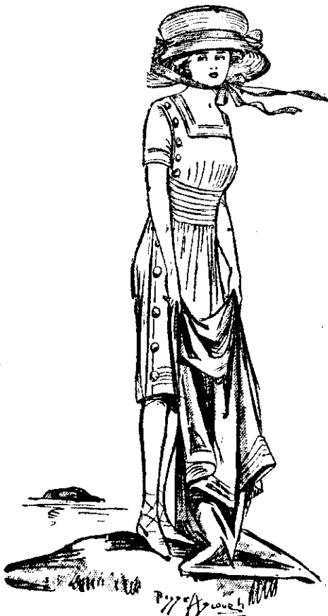
A PRETTY BATHING DRESS,

fashioned of fine cream serge or white alpaca have collars and trimming of pale blue silk and striped blue and white sashes, while scarlet will always have its need of attention from dark women, and mauve and white provide another charming alliance which deserves mention.