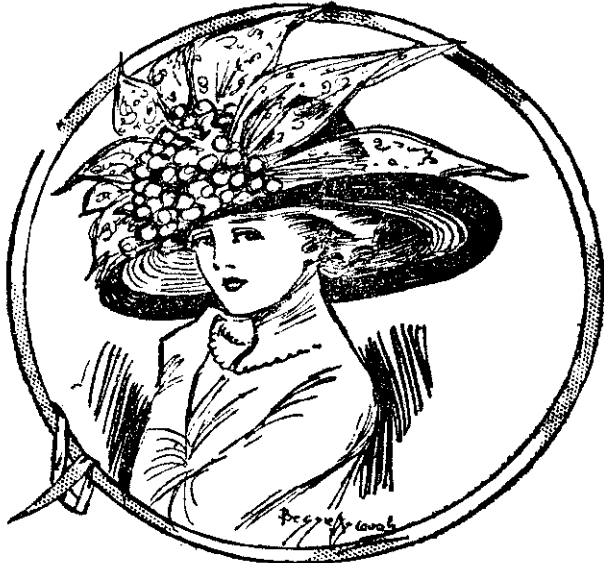
HAT OF CORN-COLOURED TAGAL,

Striped materials are always effective for bathing dresses, and draped washing silks trimmed with plain materials will be largely employed this season, while natural tussore adorned with black is used in many instances, and black and blue alpaca have both their claim to attention. Some very pretty garments