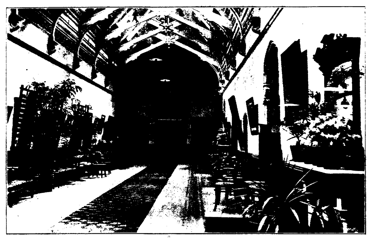
THE LOBBY OF PARLIAMENT BUILDINGS, WELLINGTON, DECORATED FOR THE RECEPTION TO LADY RANFURLY.