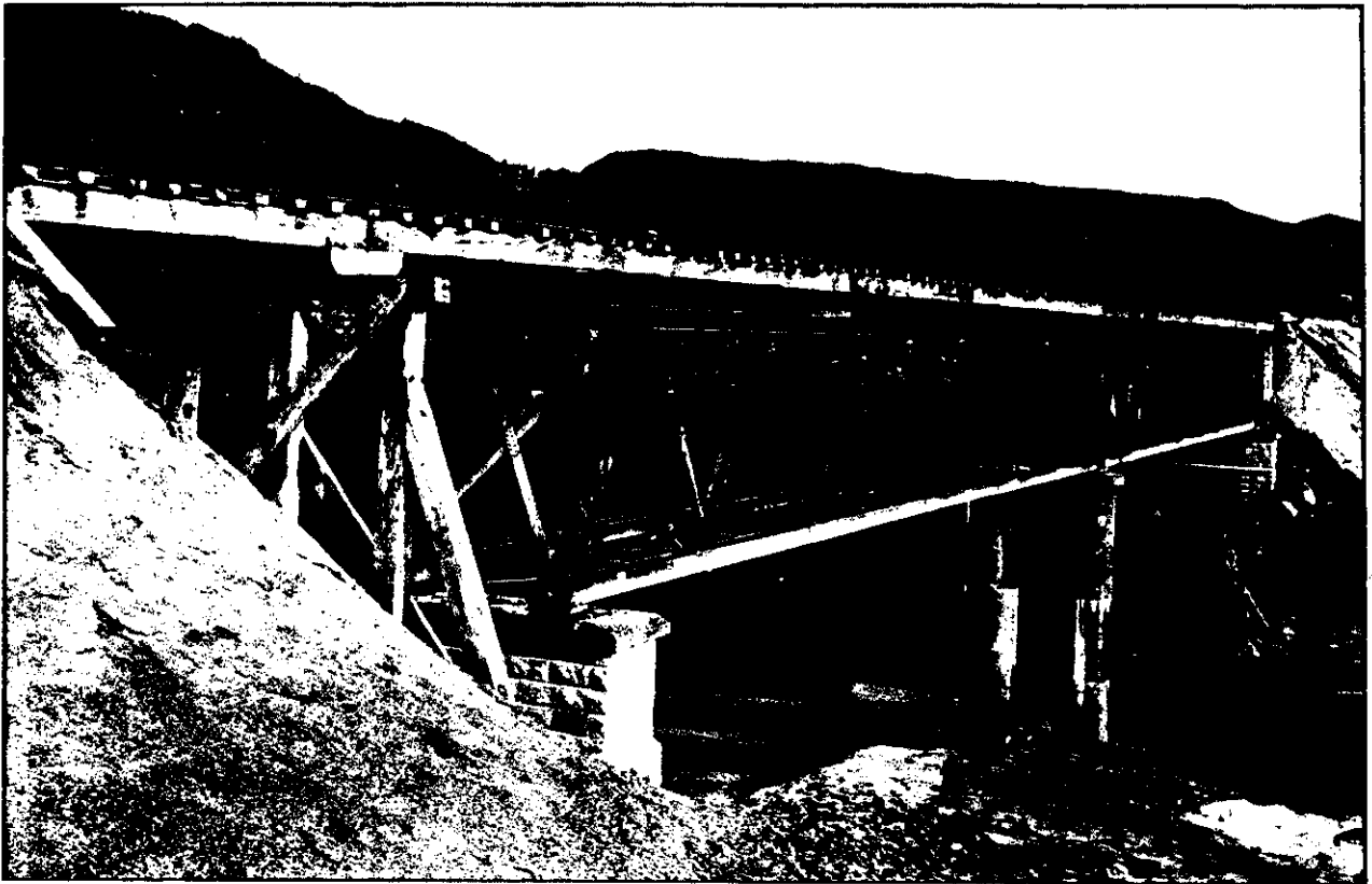
NEW BRIDGE OVER THE ONGARUE RIVER.