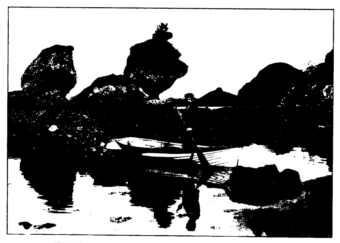
THE MUSHROOM ROCKS, SHOWING THE HAYSTACK AND ST. PAUL'S IN THE DISTANCE.