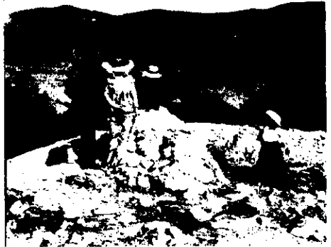
LADY CONSTANCE KNOX NAMING NORTHLAND GEYSER.