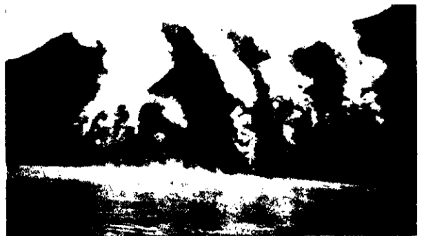
STEAMING CLIFF, 200 FEET HIGH.