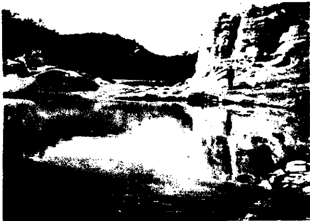
ALUM CLIFFS, WAIOTAPU.