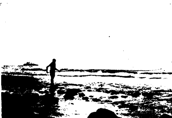
NATIVE FISHING, TAHITI.