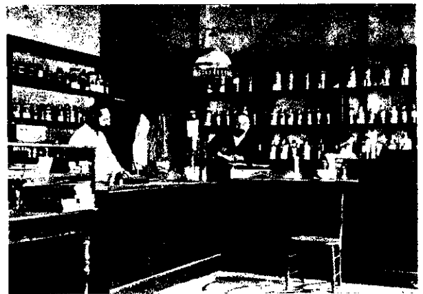
A CHEMIST'S SHOP, TAHITI.