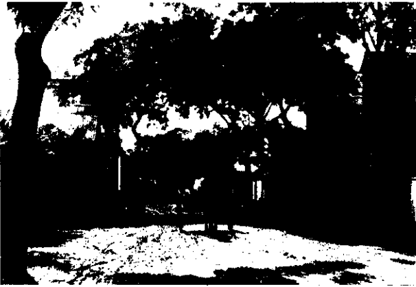
PRINCIPAL STREET, TAHITI.