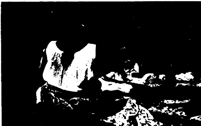
WASHING DAY, TAHITI.