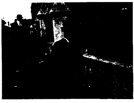
A KERBSTONE POLITICIAN.