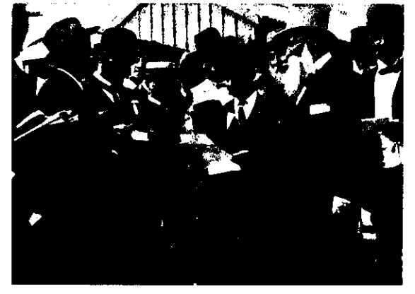
A QUINTETTE AT ST. JAMES HALL.