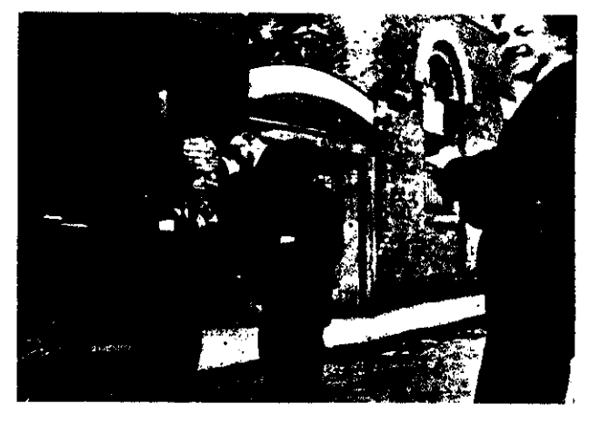
WHY "THE DOCTOR" DID NOT GO HOME TO LUNCH.