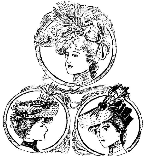
SOME SMART HATS.

Address— German Electric Appliance Agency, ARCADE BUILDINGS, 63 Elizabeth-street, Sydney, N.S.W.