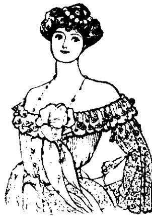
A DAINY EVENING BODICE.

Millinery is very charming even now, and this season will see some of the most charming models ever displayed for our ruination. The pretty hat sketched is not, however, of a costly nature, although it is distinguished by its smartness. The hat is of straw, the edge of the brim being coloured a pale green. The crown is low and flat, and the brim which curves up from the face is trimmed inside with a bird in whose plumage white and an iridescent greenish black with a hint of blue in it are intermingled as in that of the magpie. A bow of bright green mirror velvet rests on the hair. There is a slight twist of good patterned lace of a soft tone of cream draped round the crown forming its sole trimming. There is something very smart looking about this style of hat with its upturned brim, and I expect we shall see it in many charming forms trimmed with different tones of tulle intermingled or wreathed with flowers of the small blossomed variety. The perfectly flat toque or hat (as either name is equally applicable) with a stiff military aigrette arranged slightly to one side is also much in vogue and is to be seen made entirely of pale toned net or chiffon, or in some instances entirely of small flowers, particularly violets. They are very becoming and certainly chic.