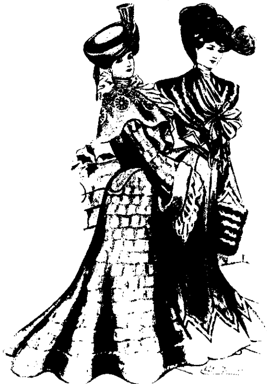
(1) A moleskin dress trimmed with chinchilla and lace. (2) A grey zibeline costumes corded with green glace over palest grey silk, and collar of sable.