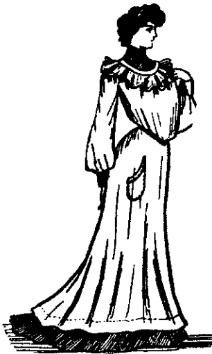
A LAY'S OVERALL.

Though pinafore days have long been left behind some at least of us cannot dispense altogether with pinafores on all occasions. The girl who takes up art, either professionally or only as a pastime, is bound to provide herself with something that will cover her dress entirely, and save it from such stains and streaks of paint as are inevitable in the studio, and it is for the artist in particular, though not solely, that the accompanying sketch has been made. The overall is made exactly on the lines of a child's pinafore, fastening behind, and reaching almost to the bottom of the dress; the sleeves are of bishop shape, but not so full as now usually worn in dresses or blouses, as the fulness would only be liable to dabble on palette or paint box, and might even spoil a picture. For the same reason the wrist bands are somewhat deep, so that the hand and wrist may be quite free. The shaped band which finishes the neck, and the pretty shoulder frill set into it renews the overall from ugliness, and the addition of a waist belt to draw in the fulness to the figure is also a great improvement on the style sometimes