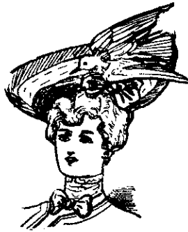
A PRETTY HAT.

Though pinafore days have long been left behind some at least of us cannot dispense altogether with pinafores on all occasions. The girl who takes up art, either professionally or only as a pastime, is bound to provide herself with something that will cover her dress entirely, and save it from such stains and streaks of paint as are inevitable in the studio, and it is for the artist in particular, though not solely, that the accompanying sketch has been made. The overall is made exactly on the lines of a child's pinafore, fastening behind, and reaching almost to the bottom of the dress; the sleeves are of bishop shape, but not so full as now usually worn in dresses or blouses, as the fulness would only be liable to dabble on palette or paint box, and might even spoil a picture. For the same reason the wrist bands are somewhat deep, so that the hand and wrist may be quite free. The shaped band which finishes the neck, and the pretty shoulder frill set into it renews the overall from ugliness, and the addition of a waist belt to draw in the fulness to the figure is also a great improvement on the style sometimes