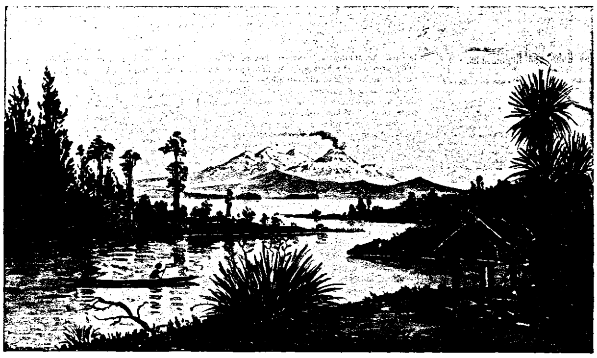
LOOKING ACROSS LAKE TAUPO TO TONGARIBO AND RUAPEHU.