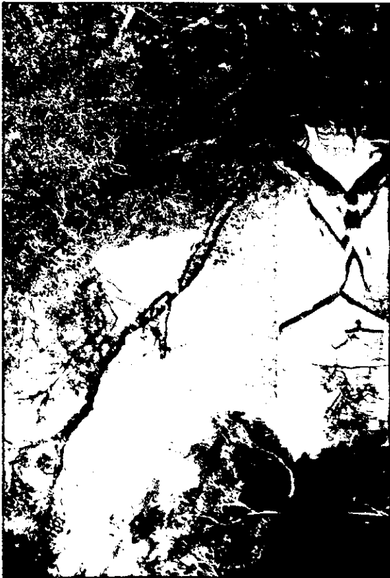
PART OF THE RITA COVE, PEGASUS.