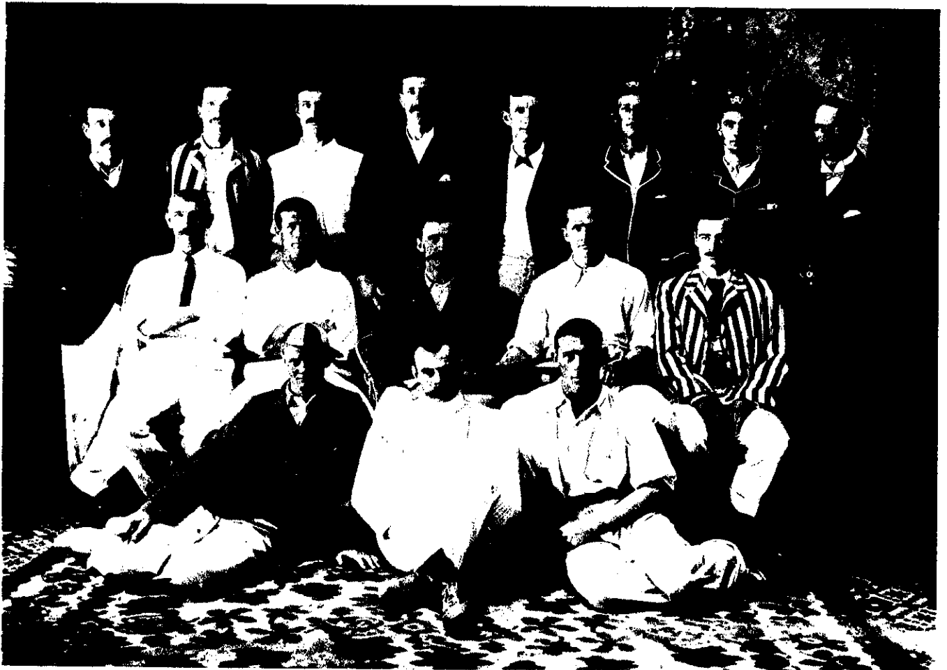
THE WANGANUI REPRESENTATIVES WHO PLAYED AGAINST LORD HAWKE'S CRICKET TEAM