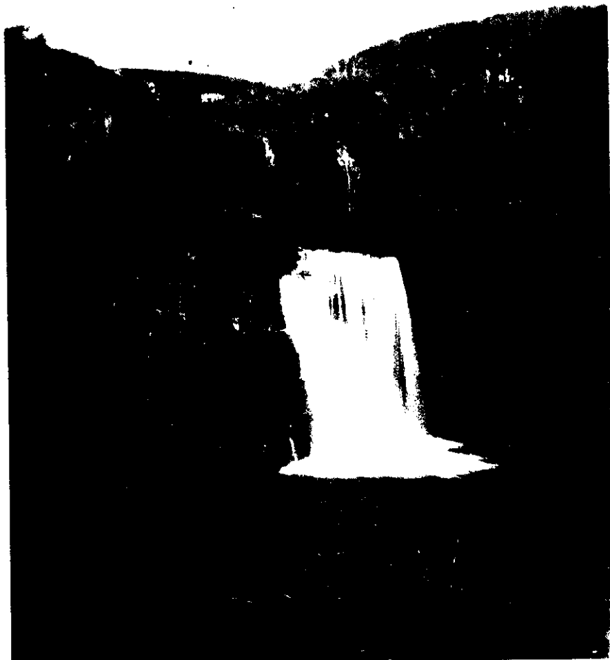
FALLS ON THE HORO HORO ESTATE, NEAR CAMBRIDGE.