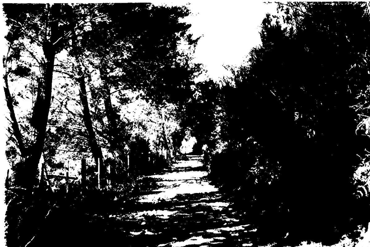
ON THE ROAD FROM TAUPŌ TO THE SPA