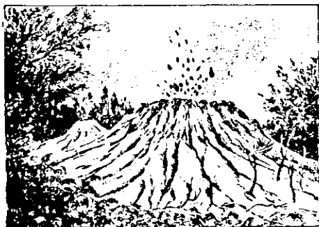
BLIND VOLCANO ON THE ROAD TO WAIOTAPU.

See its lovely, Picturesque Lakes, its Magnificent Waterfalls and Rivers. Visit its great Fiords and Sounds. Climb its Towering Mountains, majestic in their immensity, and hoary with perpetual snow. Visit the Government "Hermitage Hotel," Mount Cook, under the shadow of the cloud-piercing Aorangi, 12,349 feet. (Thos. Cook & Son's Coupons accepted.) The home of the Tattooed Maori Warriors and their handsome, dusky daughters. Visit this wonderful country with its endless variety of beautiful and magnificent scenery which charms the senses, inspires the imagination and challenges comparison. Stalk its thousands of Wild Red Deer and Fallow Buck. Whip its rippling streams, teeming with Rainbow, Loch Leven and Brown Trout. For Pure Air, Pure Water, and a Temperate Climate. The Holiday Resort for the brain-weary and jaded man of business. The Ideal Home for the man of leisure. Four days from Australia. Seventeen days from San Francisco. Twenty-six days from London.