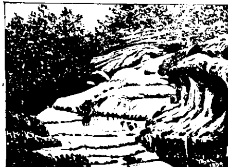
THE YELLOW TERRACE, WAIOTAPU.