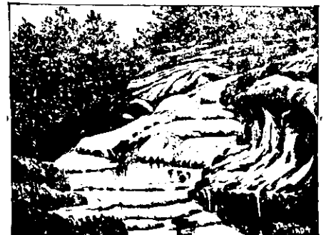
THE YELLOW TERRACE, WAIOTAPU