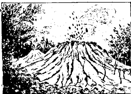
MUD VOLCANO ON THE ROAD TO WAIOTAPU.

See its lovely, Picturesque Lakes, its Magnificent Waterfalls and Rivers. Visit its great Fiords and Sounds. Climb its Towering Mountains, majestic in their immensity, and hoary with perpetual snow. Visit the Government "Hermitage Hotel," Mount Cook, under the shadow of the cloud-piercing Aorangi, 12,349 feet. (Thos. Cook & Son's Coupons accepted.) The home of the Tattooed Maori Warriors and their handsome, dusky daughters. Visit this wonderful country with its endless variety of beautiful and magnificent scenery which charms the senses, inspires the imagination and challenges comparison. Stalk its thousands of Wild Red Deer and Fallow Buck. Whip its rippling streams, teeming with Rainbow, Loch Leven and Brown Trout. For Pure Air, Pure Water, and a Temperate Climate. The Holiday Resort for the brain-weary and jaded man of business. The Ideal Home for the man of leisure. Four days from Australia. Seventeen days from San Francisco. Twenty-six days from London.