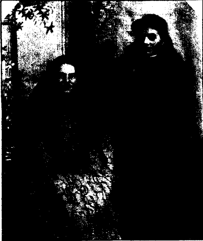
MAIDS OF MAORILAND.

Each bridegroom had received a golden vessel for his libation, and when the last of these had been announced by trumpets to the multitudes without the brides entered the banquet-hall and took their places.