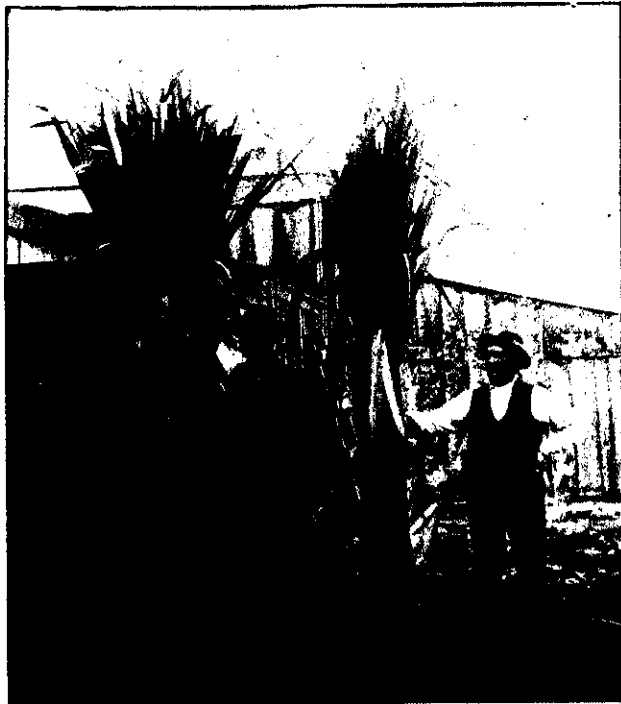
A SPECIMEN OF TALL FLAX MEASURING 13 FEET.