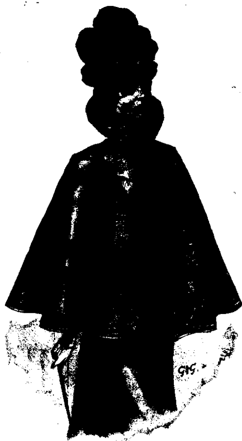
This is an up-to-date cape of fawn-hued cloth, braided all over in a striking design with braid of a corresponding colour.

I am giving you a design for a very simple Empire frock for evening wear. It would look charming in black chiffon. Crepe de chine is equally lovely and wears well; certainly, it is expensive to buy, but in the long run you will find it more economical than chiffon. The frock is a simple one, hanging loose from the decolletage, where it is softened by some narrow frills; a very long sash passes round the body under the arms, tying in a bow at the back, with the ends hanging down on to the skirt. The hem of the skirt is finished with ruchings of black chiffon, and the long transparent ruched sleeves are composed of the same fabric.