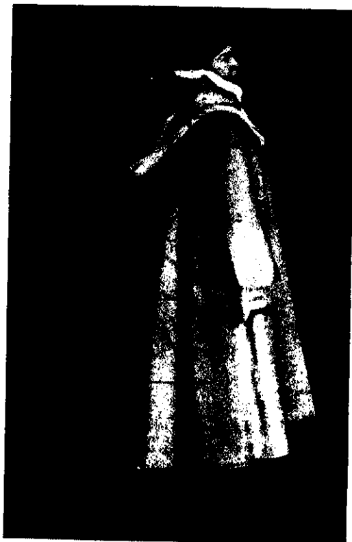
A CARRIAGE OR EVENING COAT.