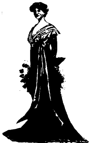
AN EMPIRE GOWN.