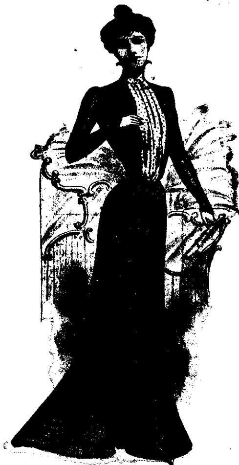
AN INDOOR GOWN.