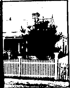
MUMARA, WEST COAST.