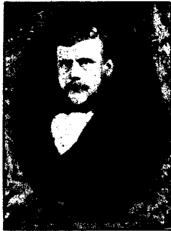
HIS APPEARANCE WHEN HE ENTERED THE PROVINCIAL COUNCIL IN 1878.