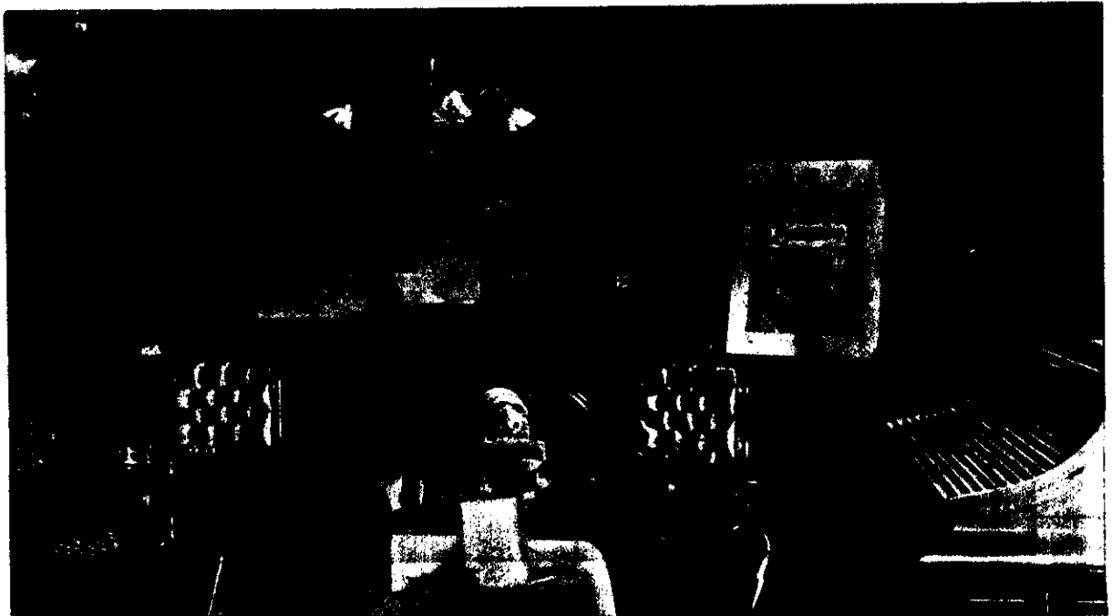
WHERE THE PREMIER WORKS IN THE GOVERNMENT BUILDINGS, WELLINGTON.