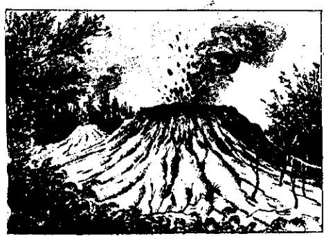
MUD VOLCANO ON THE ROAD TO W AIOTAPU

See its lovely, Picturesque Lakes, its Magnificent Waterfalls and Rivers. Visit its great Fiords and Sounds Climb its Towering Mountains, majestic in their immensity, and hoary with perpetual snow. Visit the Government "Hermitage Hotel," Mount Cook, under the shadow of the cloud-piercing Aorangi, 12,349 feet. (Thos. Cook & Son's Coupons accepted.) The home of the Tattooed Maori Warriors and their handsome, dusky daughters. Visit this wonderful country with its endless variety of beautiful and magnificent scenery which charms the screes, inspires the imagination and challenges comparison. Stalk its thousands of Wild Red Deer and Fallow Buck. Whip its rippling streams, teeming with Rainbow, Loch Leven and Brown Trout. For Pure Air, Pure Water, and a Temperate Climate. The Holiday Resort for the brain-weary and jaded man of business. The Ideal Home for the man of leisure, Four days from Australia. Seventeen days from San Francisco. Twenty-six days from London.