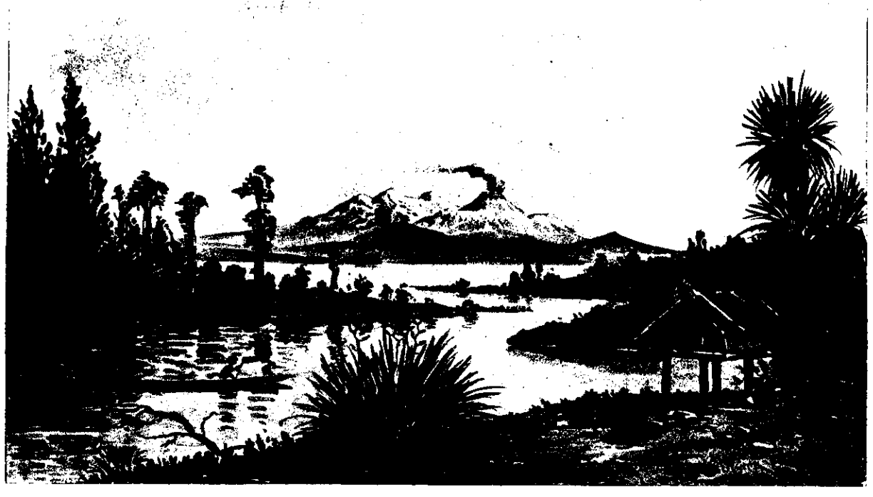
LOOKING ACROSS LAKE TAUPO TO TONGARIRO AND RUAPEHU.