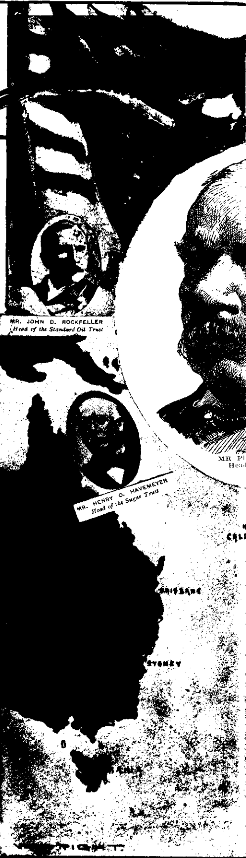
MR. JOHN D. ROCKFELLER Head of the Standard Oil Trust