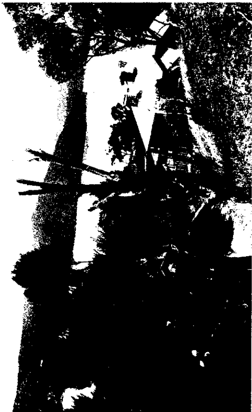
OPCA, THE PORT OF THE BAY OF ISLANDS.