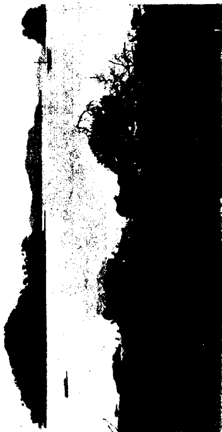
PEACH ISLAND, BAY OF ISLANDS.