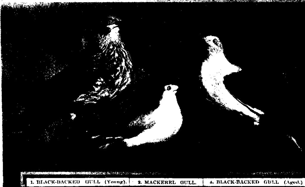
1. BLACK-BACKED GULL (Young). 2. MACKEREL GULL. 4. BLACK-BACKED GULL (Aged.)

The mackerel gull is easily tamed, and will do much good in a garden, eating snails, etc. It will eat cooked vegetables or almost any scraps, but prefers raw meat. Sir Walter Buller chronicles the peculiar fact that, when tamed, this bird is very fond of music, and will always come to a window if music is being played in the room.