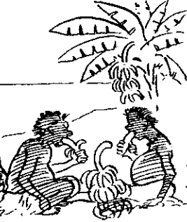
THE AUSTRALIAN FEDERAL TARIFF HOW IT WORKS OUT ON THE BANANA ISLANDS.