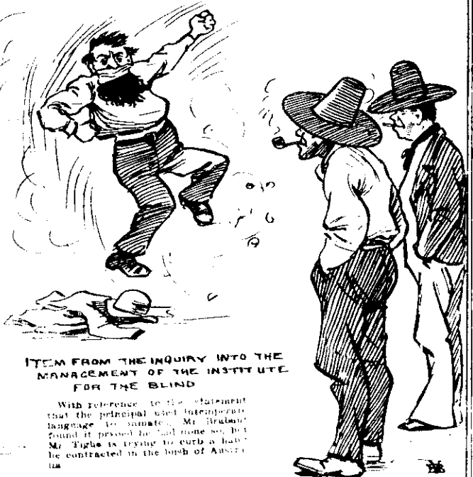
ITEM FROM THE INQUIRY INTO THE MANAGEMENT OF THE INSTITUTE FOR THE BLIND

VISITOR — WHAT ARE THOSE DREARY FUNERAL LOOKING BLACK TREES ONE SEES PLANTED EVERYWHERE ABOUT HERE? RESIDENT — OH THEM! THOSE ARE THE PINUS INSIGNIS, THE HUCKLAND CITY COUNCIL HAD THEM PLANTED BECAUSE THEY THOUGHT IF THE PLACUE GOT HERE IT WOULD BE CHEAPER TO GROW WOOD FOR COFFINS THAN TO CLEAN UP THE TOWN.