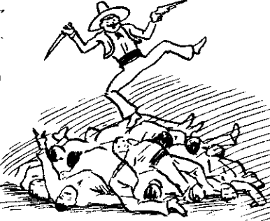
In one battle recently some 2000 Venezuelans encountered a similar number of Colombians, and were defeated with a loss of 600 men and 30 officers killed.