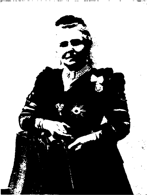
THE MOST RECENT PORTRAIT OF THE LATE EMPRESS FREDERICK.