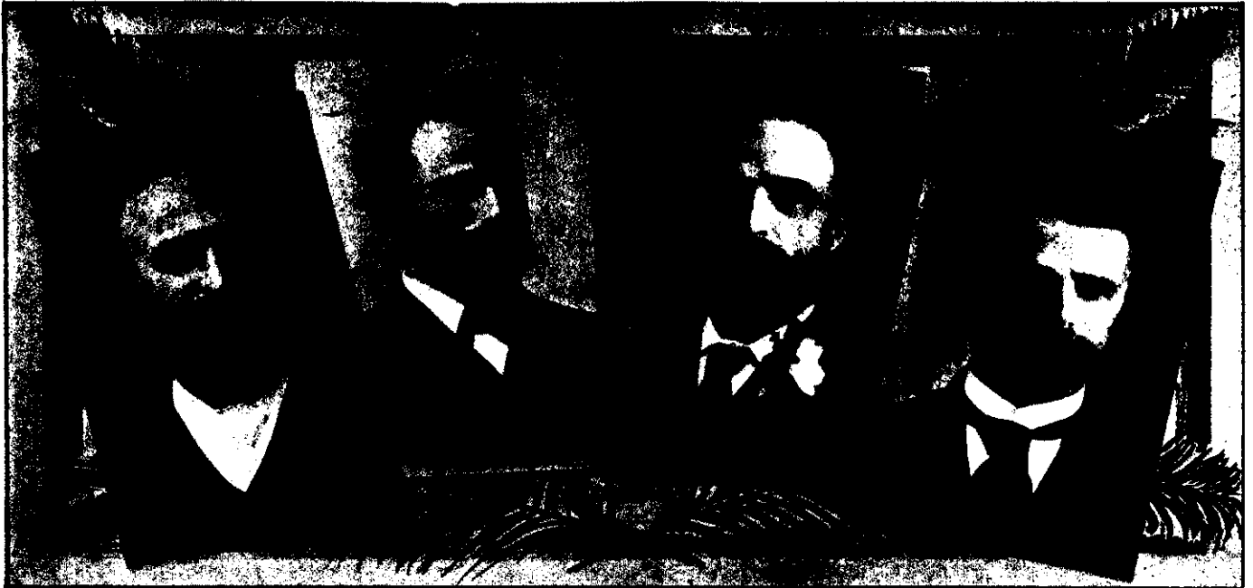
THE CHIEF ORGANISERS OF THE RECEPTION.