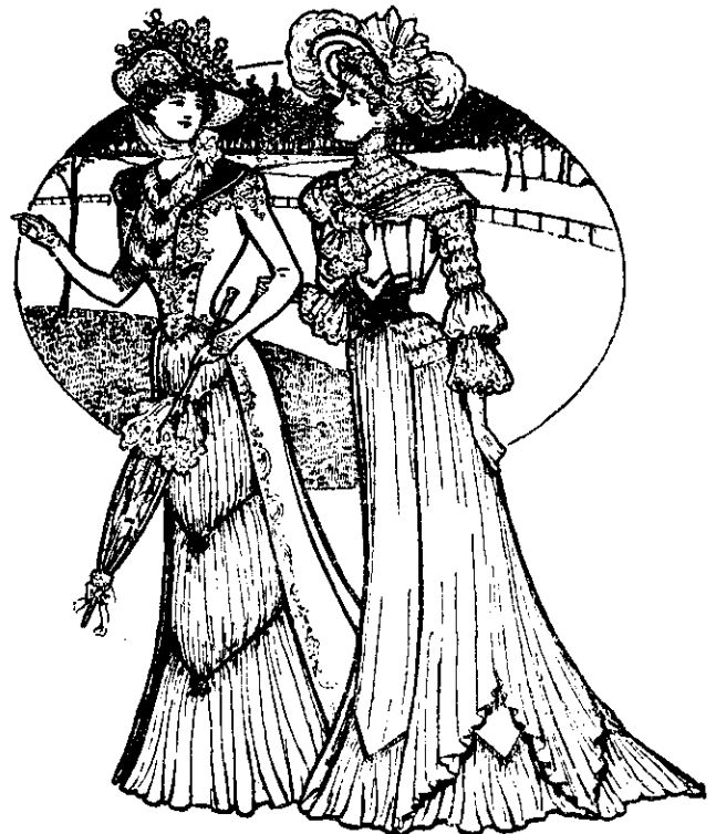
ELABORATE TOILETTES SUITABLE FOR A GARDEN PARTY.

The gown on the left hand is made of beige batiste, with touches of gold over white mousseline de soie, and the other is a turquoise-blue mousseline and linen gown very elaborately