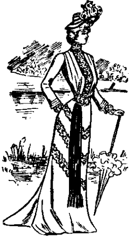
A CHARMING LINEN GOWN.

This very charming linen gown is expressed in a pretty shade of pale blue, the corselet and trimmings being