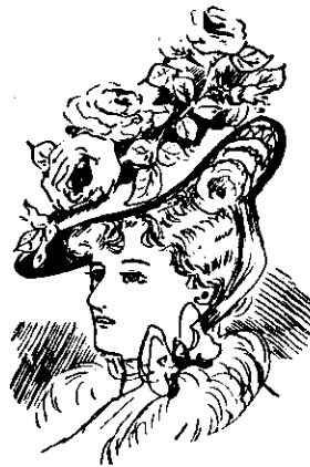
A PICTURE HAT.

In the world of millinery the most conspicuous novelty is the hat whose brim turns abruptly back from the face with a large bow of silk or bunch of flowers. Other hats, again, resemble nothing so much as a large flat plate, and are supported on the hair, which is much puffed out by a broad bandeau. These are made out of crinoline straw cunningly woven to imitate lace. Such are trimmed with