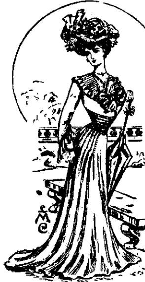
A COOL DRESS FOR THE SUMMER

White voile is the fabric chosen for this ideal summer gown, but the belt and bow are to be of old-gold silk, while the vest is a white one run through with gold ribbon. Stitched blue and white linen with a front of