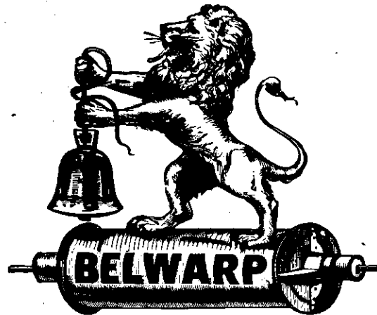
REGISTERED TRADE MARK.

This Mark, stamped in Gold on the back of each yard, guarantees it to be one of