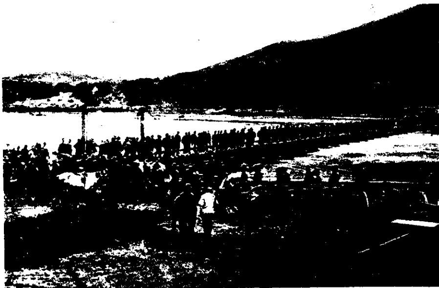
BRITISH INFANTRY CROSSING NORVAL'S PONT PONTON BRIDGE, SOUTH AFRICA.

Female fashions are rapidly depopulating the bird world. The song birds are especially noted for their beautiful plumage and are rapidly disappearing, and now the bird murderers are beginning their destructive work in other directions. The sea birds, and especially the gulls, are vanishing from the Atlantic coast, thousands of them having been slaughtered every year to supply the demand for female adornment and to gratify female vanity. If the various States do not soon enact laws with heavy penalties attached forbidding the destruction of birds bird life will soon become extinct.