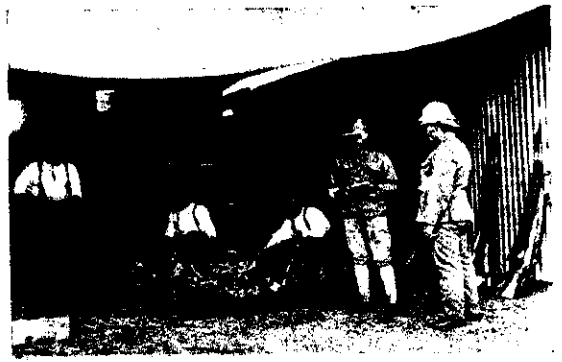
AN ARMOUR STORE.