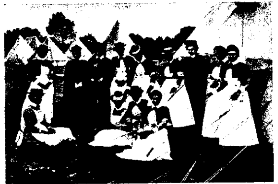
NURSES OF THE PORTLAND HOSPITAL.