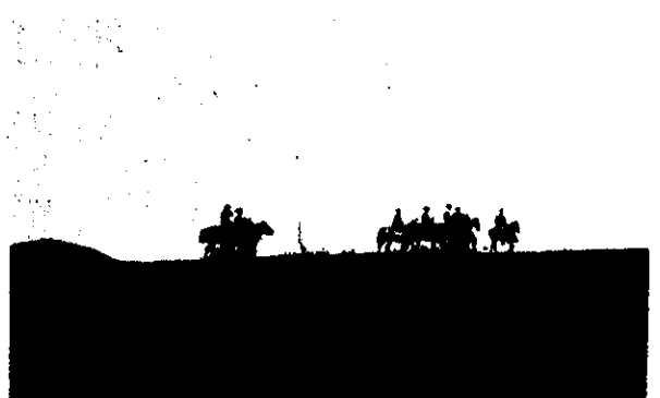
A PARTY OF NEW ZEALANDERS SCOUTING.