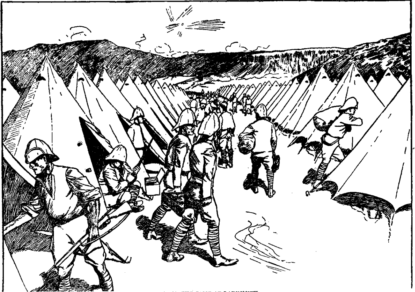
VIEW OF THE CAMP AT LADYSMITH.

The troops at Ladysmith have become so accustomed to the bombardment from the Boer guns that they pursue their ordinary duties in camp in the same undisturbed manner under the heaviest firing as when the Boer artillery have closed down for the day.