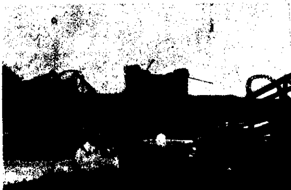
THE BRIDGE AT FRERE, DESTROYED BY THE BOERS.