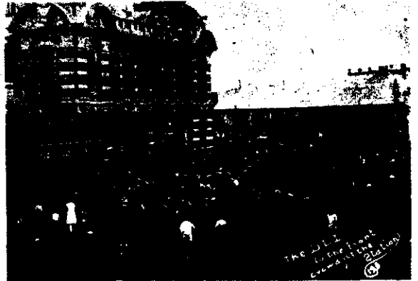
THE DURBAN LIGHT INFANTRY'S DEPARTURE FOR THE FRONT.