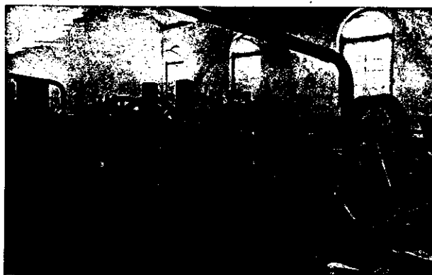
Illustration of Pumping Plant recently supplied by John Chambers and Son Ltd., to the Onehunga Borough Council Waterworks, capable of delivering 30,000 gals. per hour, 350ft high. Pumps are driven by TANGYE SUCTION GAS ENGINES & PRODUCERS

10 BRAKE HORSE POWER FOR ONE PENNY PER HOUR.