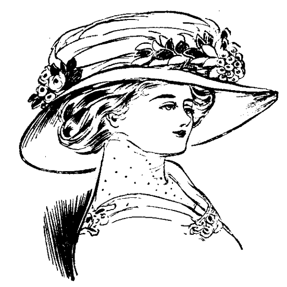
DAINTY HAT FOR SUMMER WEAR.

mauve chip, has a band of pale turquoise velvet ribbon, and two large blue feathers fastened with a La France rose—all these pretty pastel shades forming a delightful combination of colour. The other lat is of fine black Tagal with a slightly rolled-back brim and full crown of black spotted net. This is held in place by a band of black velvet ribbon and a wreath of pink roses. At the top there is a smart model suitable for travelling or motoring. It is a happy compromise between a hat and a bonnet, and is of light golden tan straw with a black satin ribbon encircling the wide crown, and at each side a cluster of black cherries. The veil is of tanceloured spotted chiffon. The beehive shape is of coarse mauve straw with masses of convolvulus blossoms, shading from faintest pink to deepest purple. The last is a biscuit straw with black straw under brim, is trimmed with soft black satin arranged in large bows at back of grown, and is suitable for morning wear, the country and the seaside.