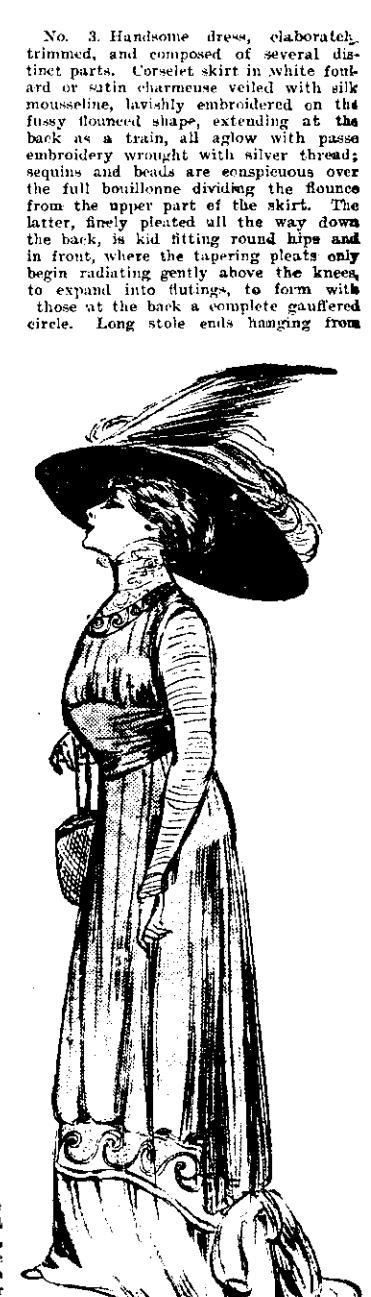
FROM AN AMERICAN TROUSSEAU

No. 2. Straight dust wrap in No. 2. Straight dust wrap in white lines or cloth picturesquely trimmed down the fronts with slamting peaks, broad hem band and bracelet round the tight and fringed elbow sleeves with quaint rustic designs in sail cloth, either entiroidered, printed, or stencilled. Futness is imparted to the somewhat severe cut semi-fitting by the introduction of a few graduated pleats at either side below the hips. Stylish roll revers in black satin or moire. satin or moire.