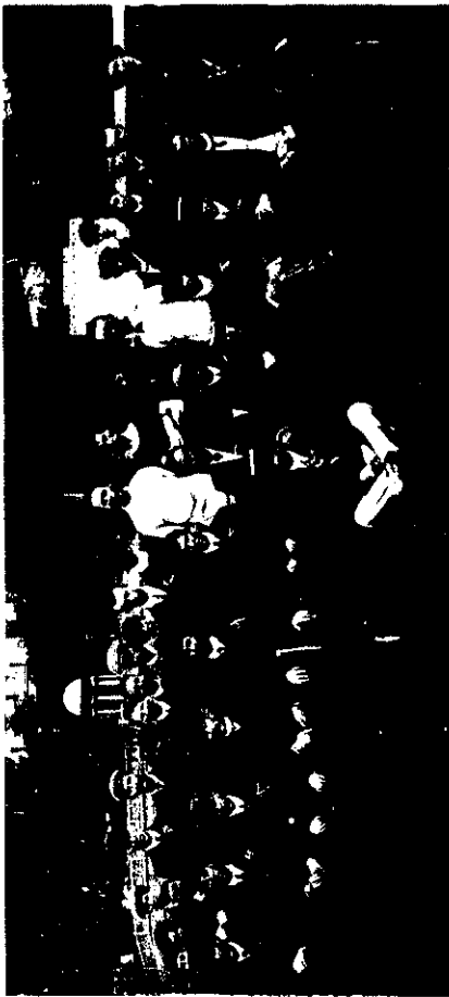
COMMITTEE OF THE WELLINGTON AMATEUR ATHLETIC ASSOCIATION.