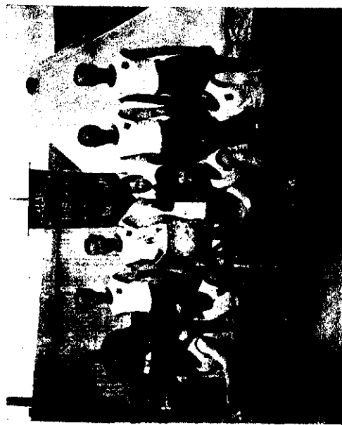
A GROUP OF THE ZEALANDIA RIFLES. North rifles, and beating them in the final col drill, after doing with the Palmerston winners of the championship cup for physist.