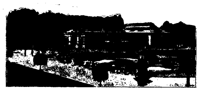
THE SEA LION POOL AND THE HOUSE FOR PERCHING BIRDS.

the bears appear to be the most satisfactory. They seldom quarrel, and entertain visitors cheerfully the season through. From early morning until dusk drives the visitor away, the bears are strictly on view. All sizes and colours,