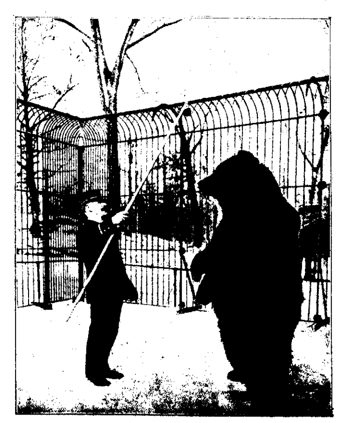
A GIANT ALASKAN BROWN BEAR.