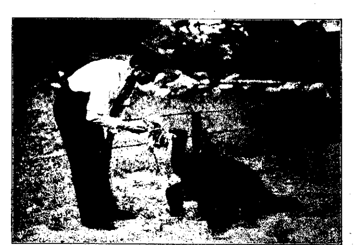
GIANT TORTOISE FROM THE GALAPAGOS ISLANDS. THE TORTOISES ARE THE MOST INTELLIGENT OF ALL THE ANIMALS.

Government and shipped to the Wichita Game Preserve in Oklahoma. The So-ciety interested the Government in its ciety interested the Government in its plan to attempt the preservation of this greatest of all American game animals by once more restoring to their native habitat specimens of a vanishing vacc. Eight thousand acres have been fenced, and when the bison are acclimatised, they will roam over it as they once did, but now under the protection of "Uncle Sam." The following census,