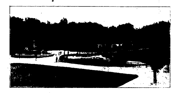
THE PRIMATE HOUSE, SHOWING THE FOUNTAIN PRESENTED BY MR. ROCKEFELLER.

is welcomed to the fraternity. Occasionally he proves to be a Tartar, and the order of proceeding reverses itself. Little Admiral, now big Admiral, a thoroughly good-natured cub, ran the gamut of sundry squalls until he proved himself the master of all. Admiral came from the Admiralty Island,