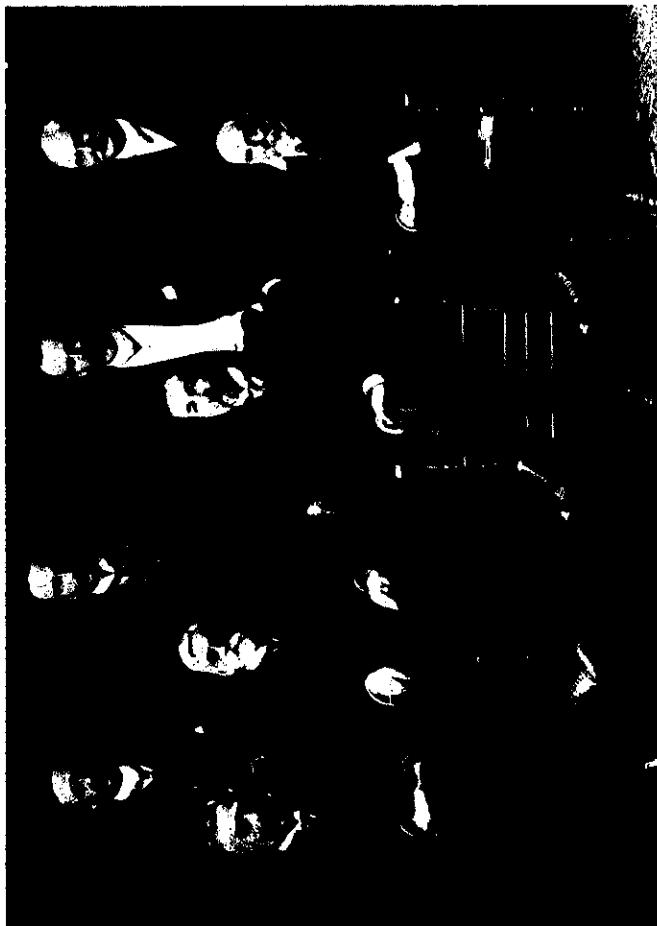
See "Our Illustrations."