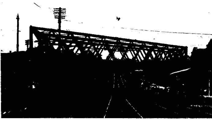
THE END OF A VEXED QUESTION.

The barque Jessic Craig recently made a record trip of three days 13 hours from Lyttelton to Auckland, in addition to which Captain Urquhart, 18 months ago, made the run from Melbourne to Auckland in seven days.